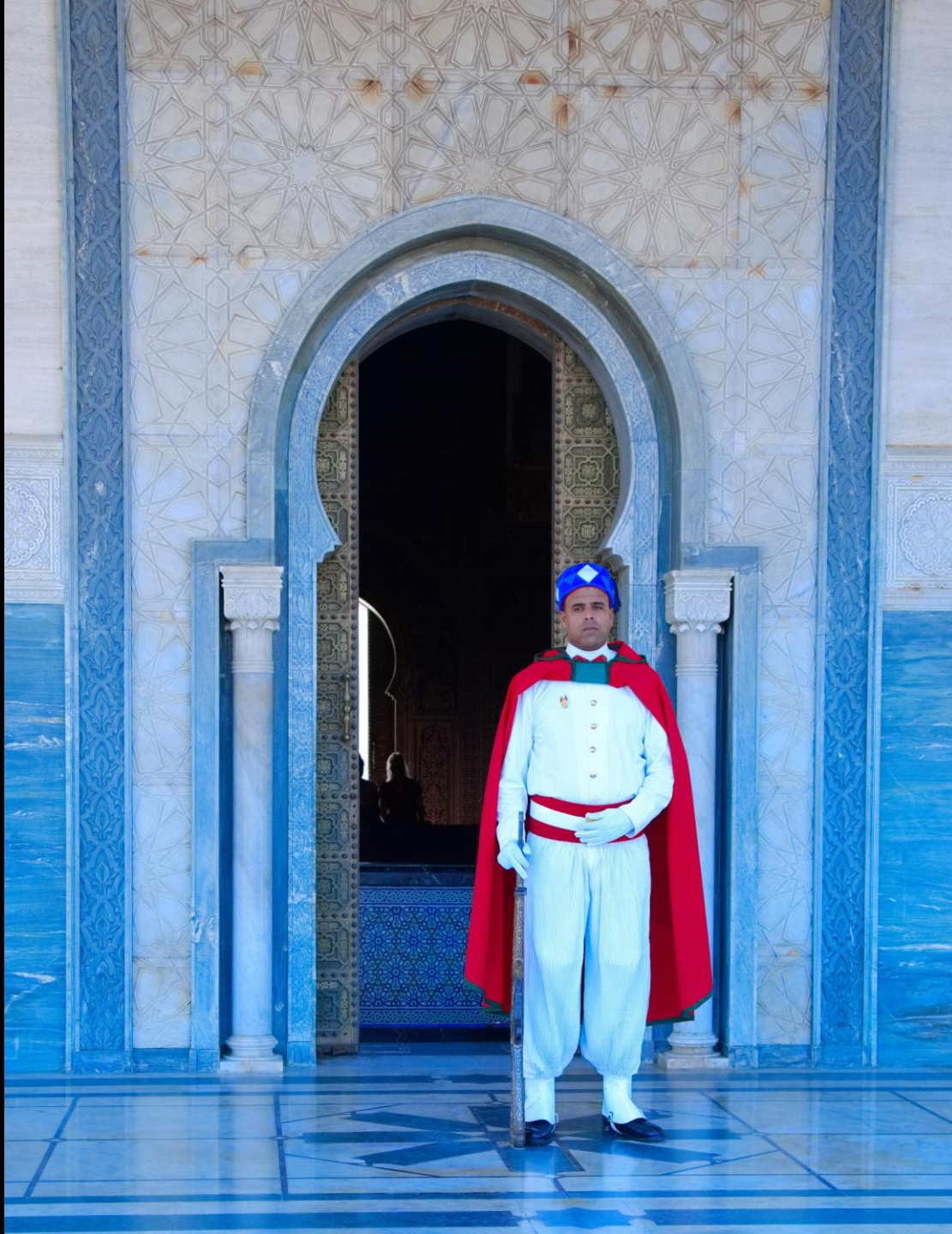
Imperial Guard Great Mosque of Fes el-Jdid