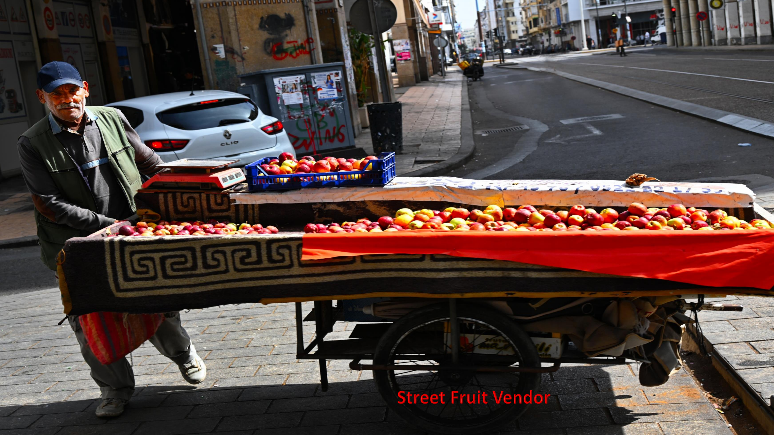
Street Fruit Vendor