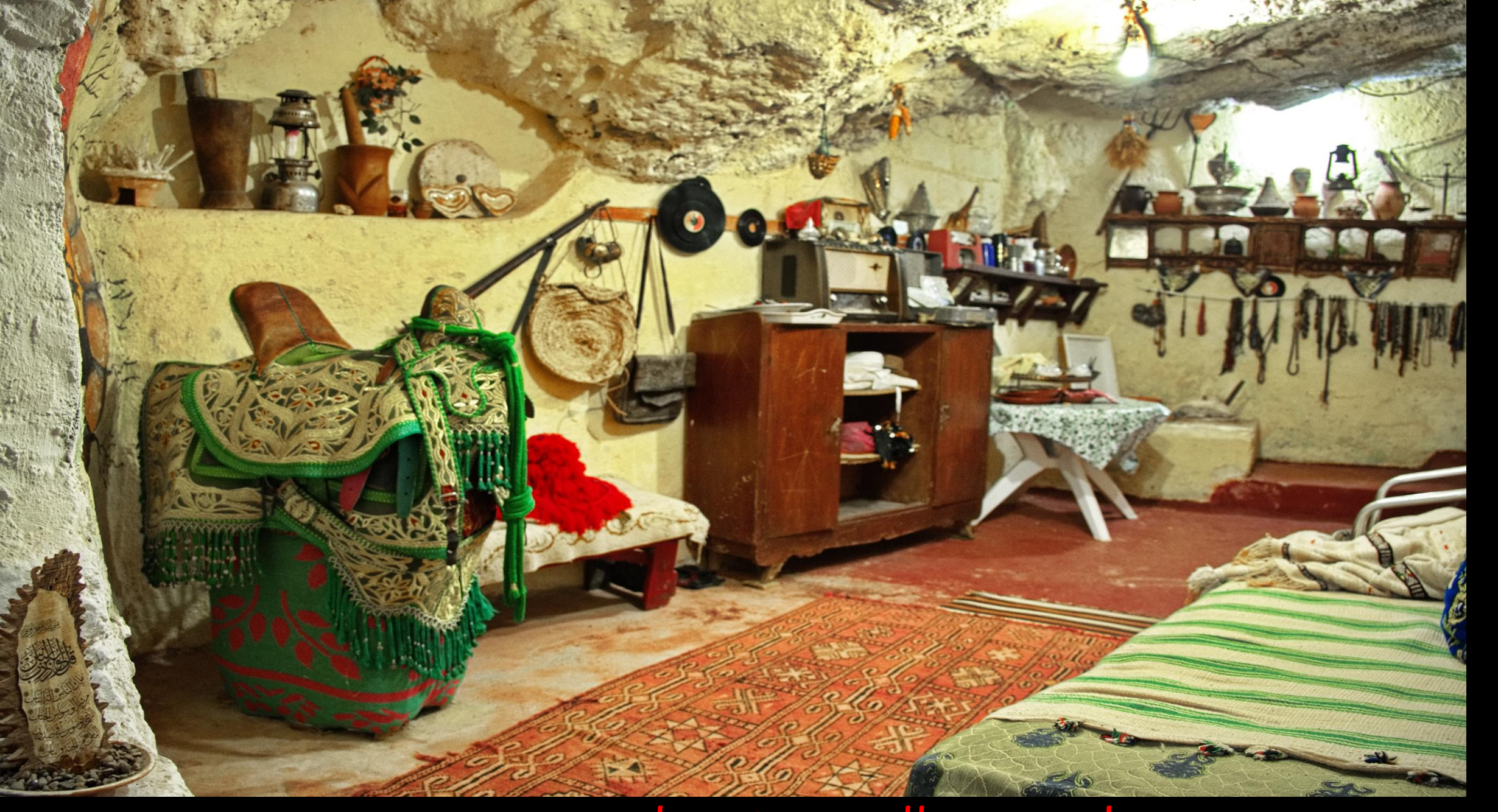
Berber Cave Village Kitchen