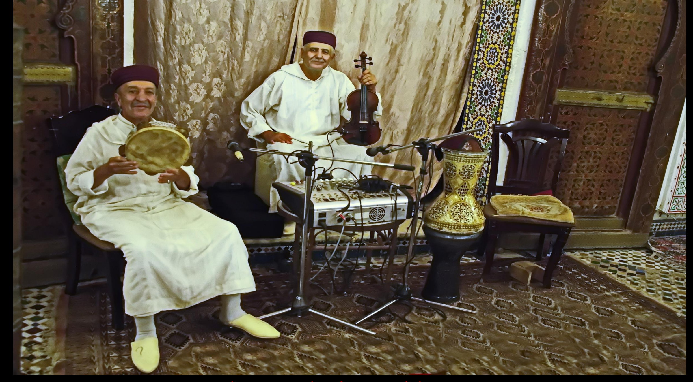
The Band of Casablanca