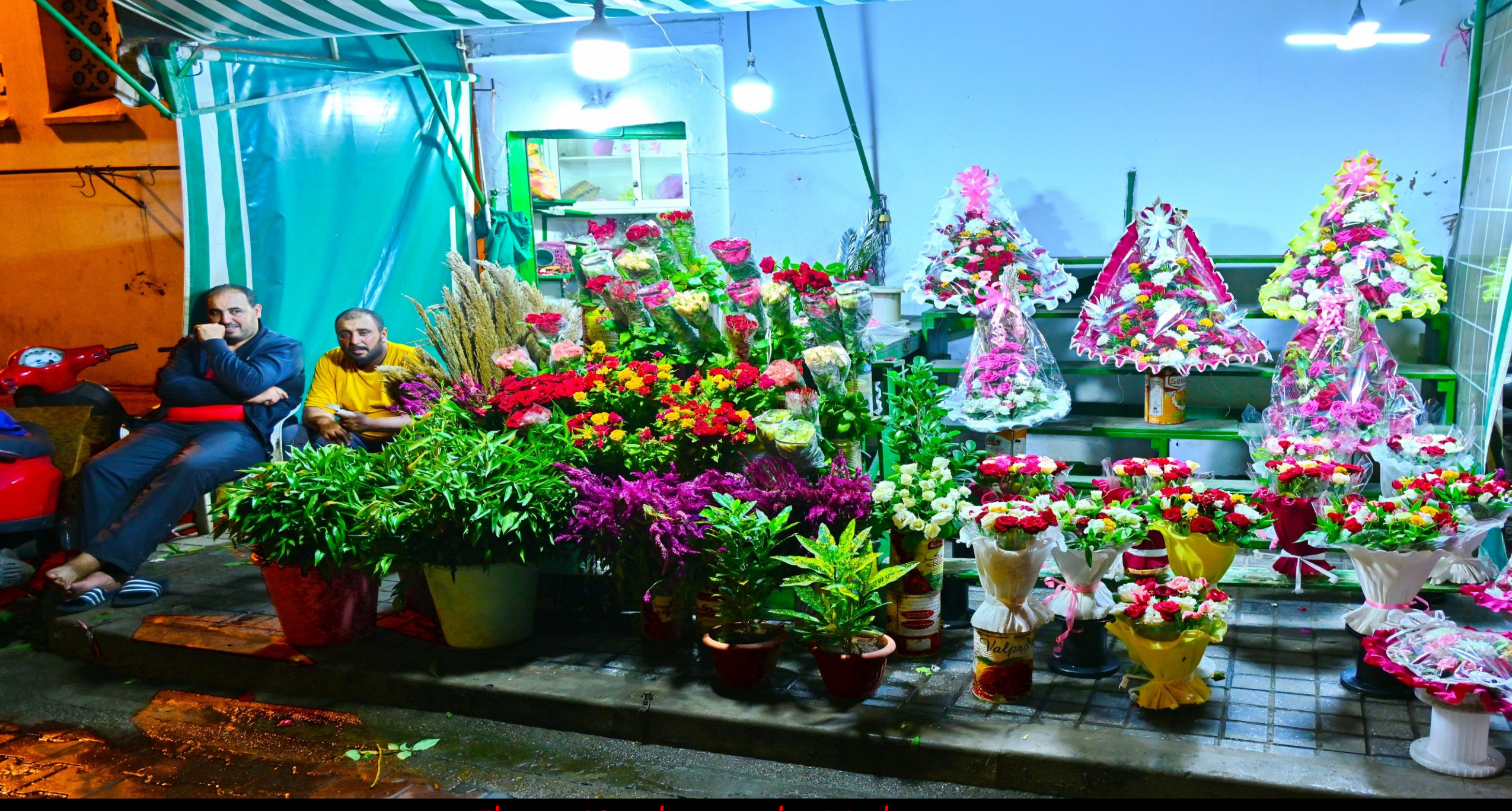
Flower Vendors in the Medina