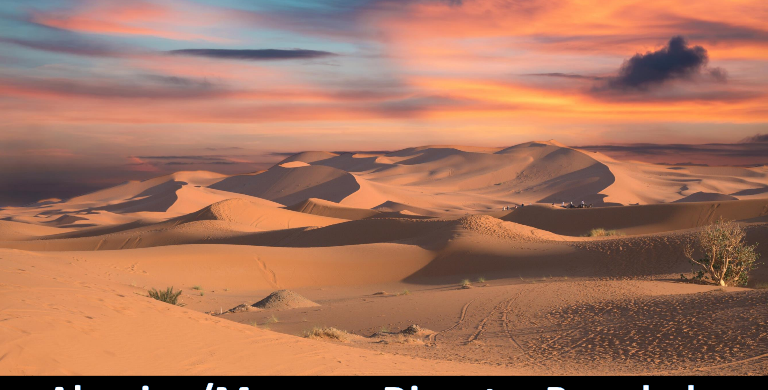
Algerian/Morocco Disputer Boarded